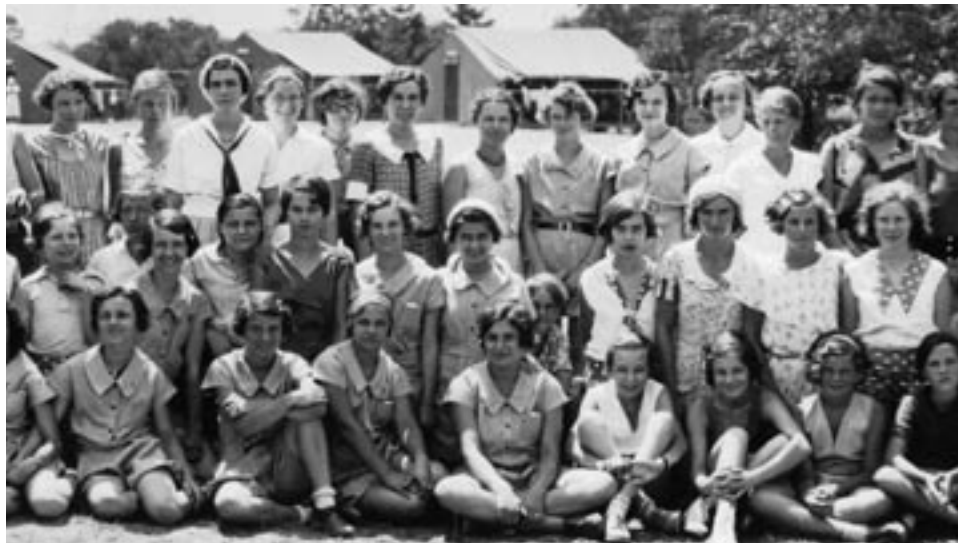
Phantom Lake Girls Reserve Camp, August 1931.