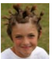
Crazy Hair Day

Day Camp has also announced it's theme weeks and will host an Open House on May 13. Sign up for six or more weeks and get Extended Care free. The Nagi Day Camp is in it's third year and is very popular so register soon to secure a spot. Nagi campers (ages 12-13) stay overnight at camp on Thursday nights. Thursday evenings are also Day Camp Family Night!