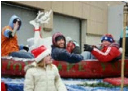
Phantom Lake Y Camp built the float for Santa and Mrs. Claus to ride on during the local Mukwonago Midnight Magic Parade.