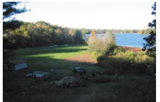
AFTER: A great view of the lake and A-field!