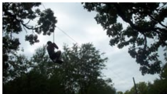
Zip Line was installed in August, 2005