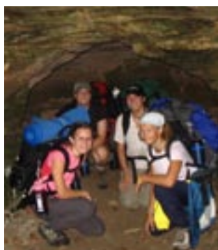
Pictured Rocks National Park