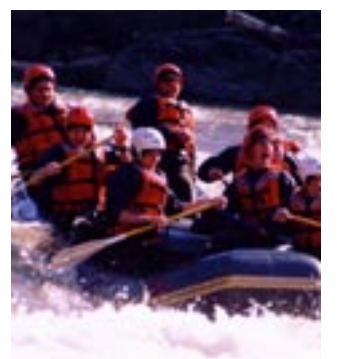
Rafting in the Smokey Mtns.