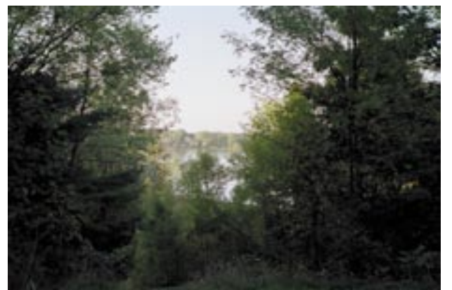
BEFORE: Where is the lake?