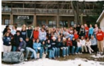
Winter Camp! The group of campers and staff enjoyed an action filled four days with just enough snow for sledding.