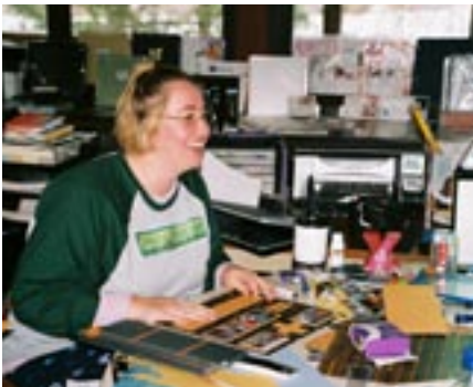
Camp Scrapalot sets up their scrap booking stations in the Dinning Hall. Over 20 women attended this year. They are just one of the many weekend groups that enjoy camp in the winter.